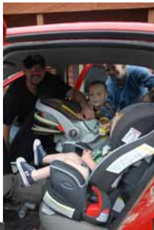
The family with all three kids safely sitting in their new car seats provided by Graco.